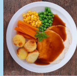
Roast Pork with Roast Potatoes and Gravy