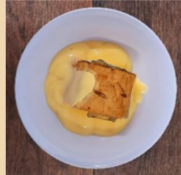
Apple Pie with Custard