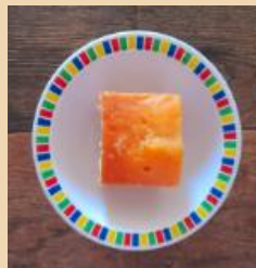
Orange Drizzle Cake