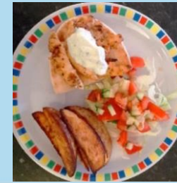
Greek Chicken Pitta with Rice and Tzatziki