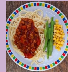
Vegan Bolognese with Pasta