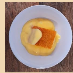
Carrot Cake with Custard