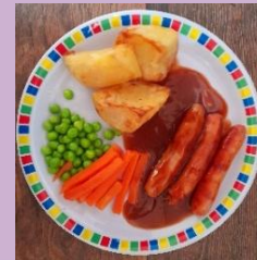
Vegan Sausages with Roast Potatoes and Gravy