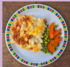
Soya Mince Pasta Bake