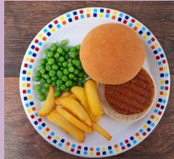
Vegan Burger in a bun with Potato Wedges & Tomato Ketchup