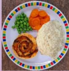
Cheese and Pepper Whirl with Herby Rice