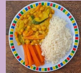
Coconut Curry with Rice