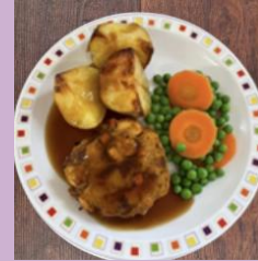
Vegetable Loaf with Roast Potatoes and Gravy