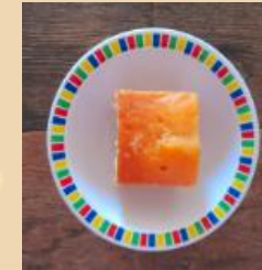
Summer Lemon Cake