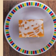
Iced Vanilla Sponge