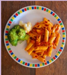
Tomato Pasta Bake