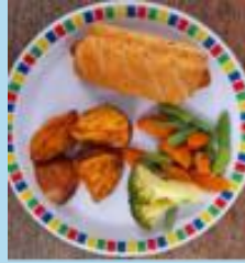
Sausage Roll with Potato Wedges & Tomato Ketchup