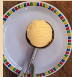
Ice Cream with Fresh Fruit